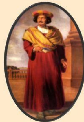
Raja Rammohan Roy