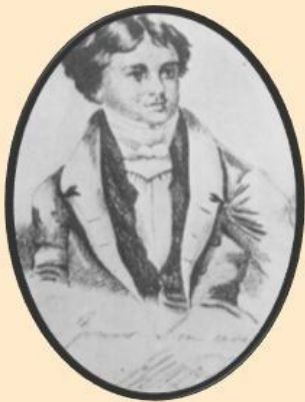
Henry Louis Vivian Derozio