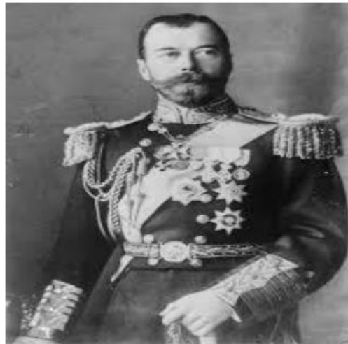
Tsar Nicholas II